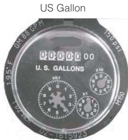
1" and 1 1/2"

Pulsar Wiring. The pulse element is a 4-watt rated reed switch which requires power from an external source. The unit is to be wired in series with no regard to polarity. Note: Maximum voltage, 24 V AC/DC, 0.2 Amp current, not to exceed 4 watts, current limit only max. resistance in series with reed switch.